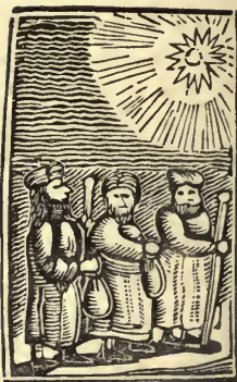
3 Wise Men.